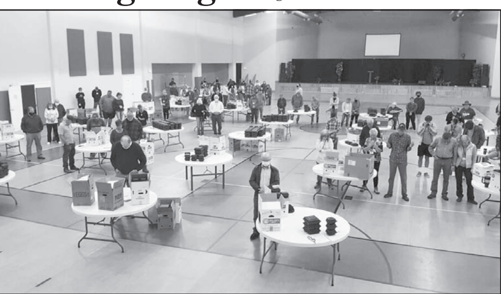
About 50 delivery drivers coordinated meal deliveries at the Family Life Center of House of Prayer before traveling all over the county to take hundreds of dinners to people needing or wanting one Thanksgiving Day.

trimmings for home delivery, pick-up by appointment, or dine-in last week, with all three options allowing for the opportunity to witness to people on Thanksgiving Day.